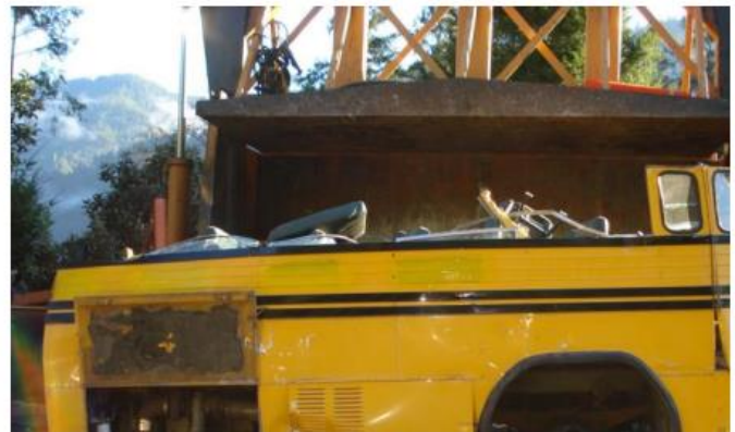
Example of acceptable destruction of vehicle chassis

Please note: CARB or its administrator may, in their sole discretion, require additional documentation to ensure scrappage requirements have been met. Additionally, in the event that funding from other sources becomes available, CARB or its administrator may require additional documentation to comply with specific requirements of the new funding source (such as Diesel Emissions Reduction Act funding).