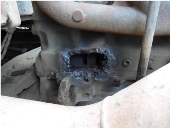
Engine: 5" hole in engine block