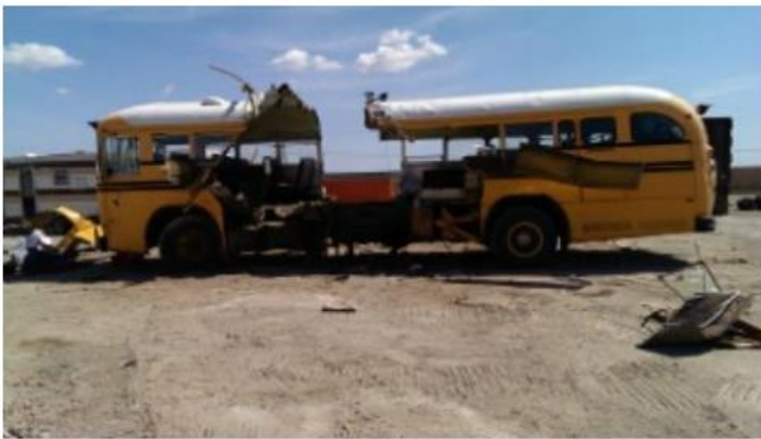
Example of acceptable destruction of vehicle chassis