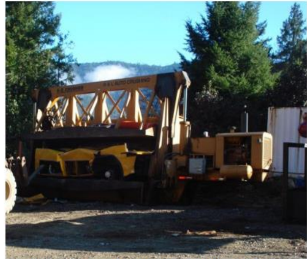
Example of acceptable destruction of vehicle chassis