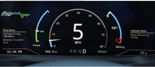
Lightning's digital dashboard provides all the information the driver needs