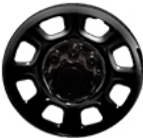
PYN Wheels , 17" (43.2 cm) steel, Black-painted