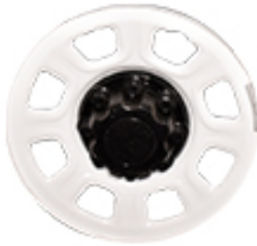
RSF Wheels , 17" (43.2 cm) steel, White-painted