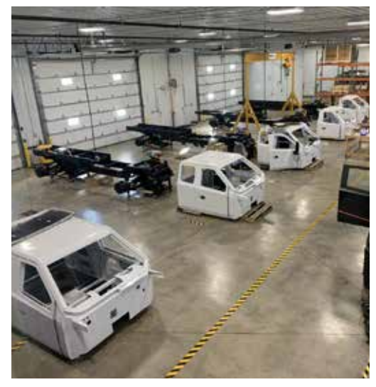
SMUD FLEET ADOPTION TRUCK PRODUCTION: JAN. 11, 2022