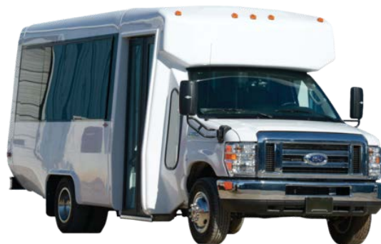
Fig 1. Model G All-Electric Shuttle Bus

NOTE: All specifications are with normal manufacturing allowances and tolerances. Product Specifications provided by Alpha Mobility, LLC. Alpha Mobility, LLC reserves the right the alter specifications as necessary. For more information please visit: alphamobility.co