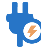
Low NOx Engine